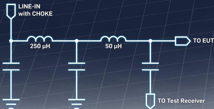
L2-16B equivalent circuit